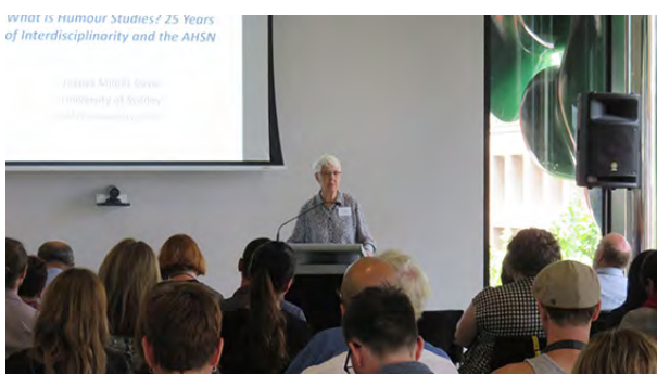
A proper keynote address.