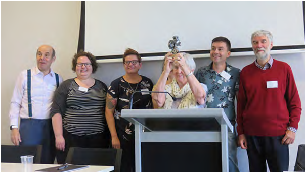
Winners are grinners!