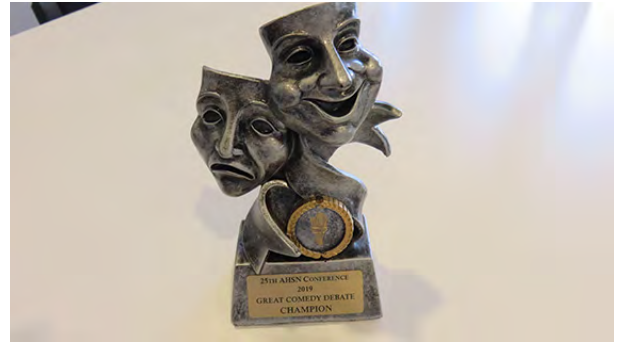
The object of desire - a beautiful trophy