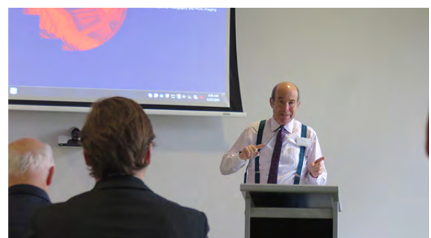
A keynote address to toy with your mind.