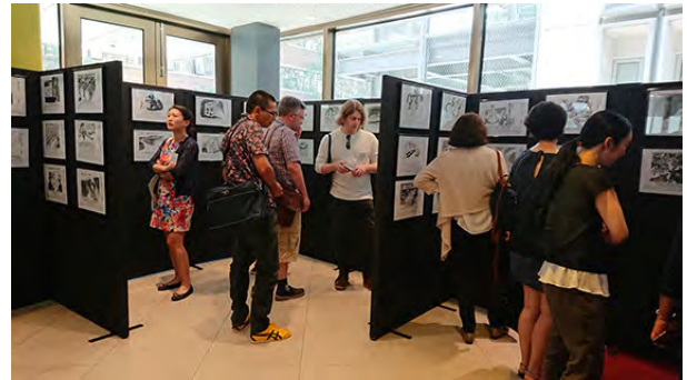
Conference delegates viewing cartoons by Yuzo Asakura (Part 2 of Cartooning Exhibition).