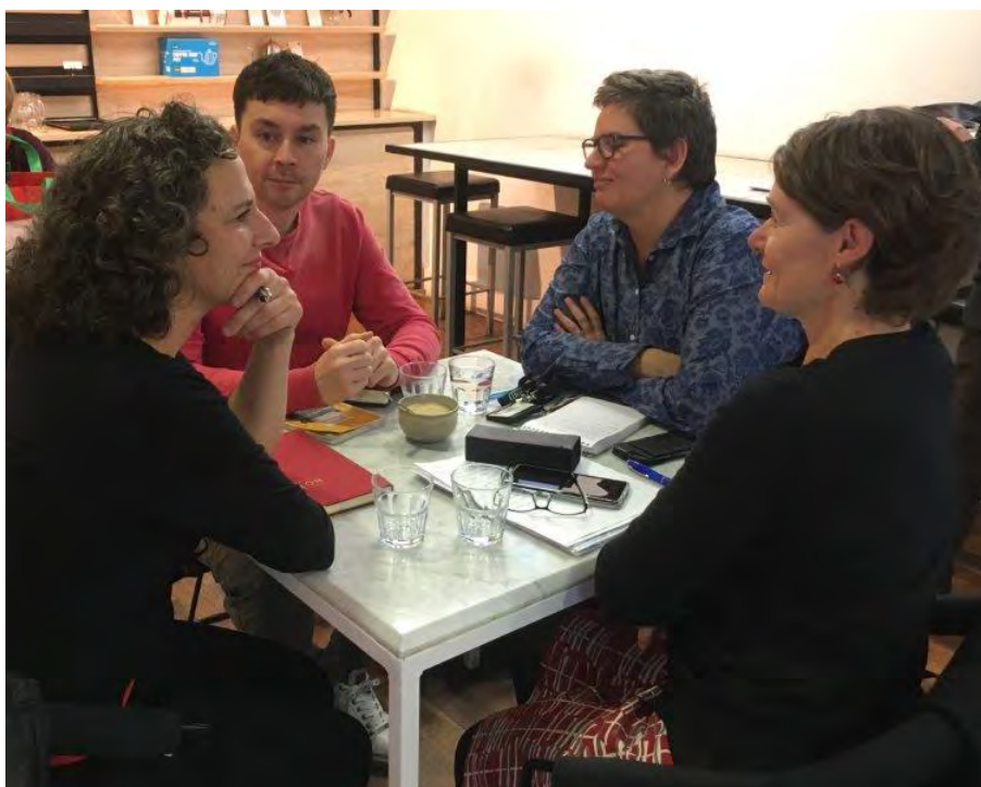
Dream team hard at work.