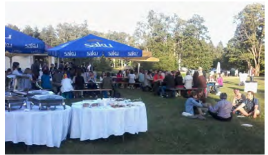
ISHS delegates did actually attend some sessions as well as feasting well!