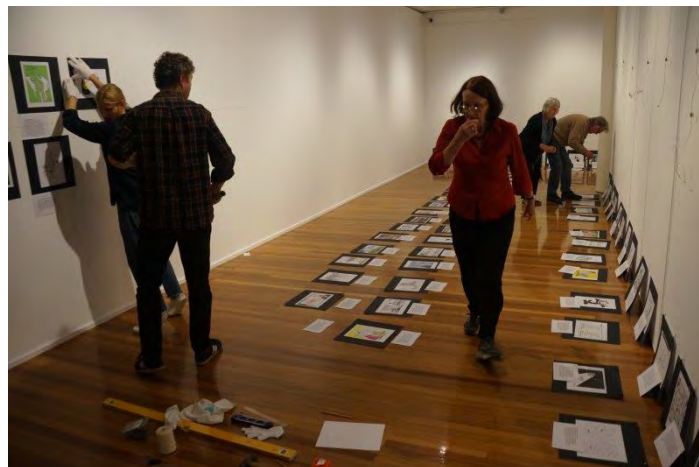
Volunteers work on mounting the 2018 Australian Cartooning exhibition, “Cartoons Should Not Be Laughed At”, showing about a quarter of the total area on display.

More details at: http://www.gleneira.vic.gov.au/Places-and-events/Arts-and-Culture/Galleries-and-Visual-Art/Exhibitions/The-2018-Cartoon-Exhibition