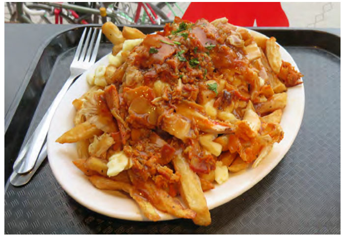
And everyone's favourite - poutine.