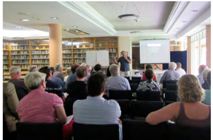
Presentation in the Library space