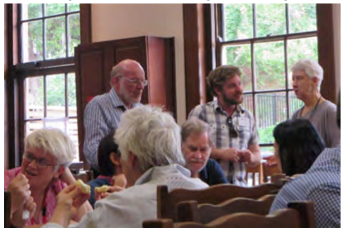
Let's do lunch!