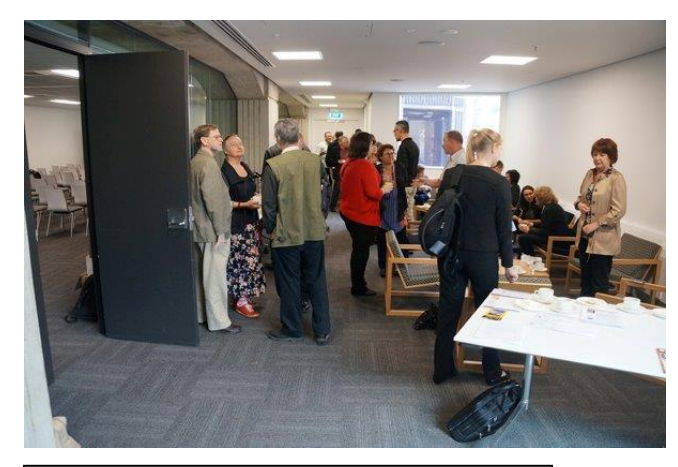
Morning tea at the Colloquium.